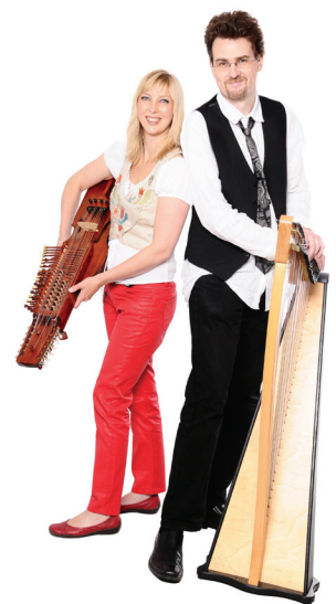
Dråm with harp and Nyckelharpa